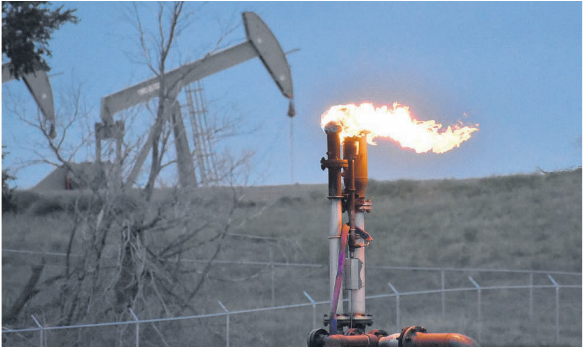
A flare burns at a well pad Aug. 26, 2021, near Wafford City, N.D.